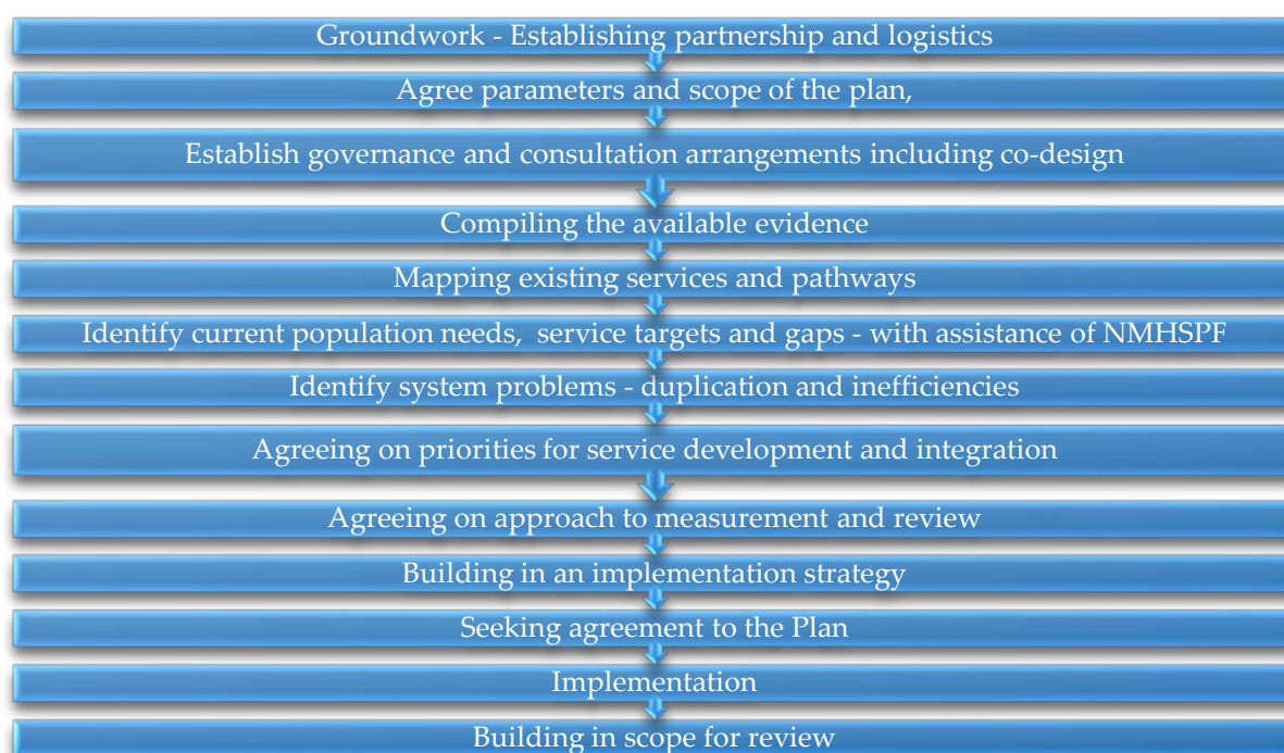
Figure 3: The process of developing a joint regional plan

Whilst it is structured within the expectations outlined in Part 1 of this guide, this section is advisory only. LHNs and PHNs are not required to follow this particular process and may vary from the steps below, or implement the steps in a different sequence. However it offers best practice advice on rigorous, evidence based regional planning and options for implementing this approach to planning.